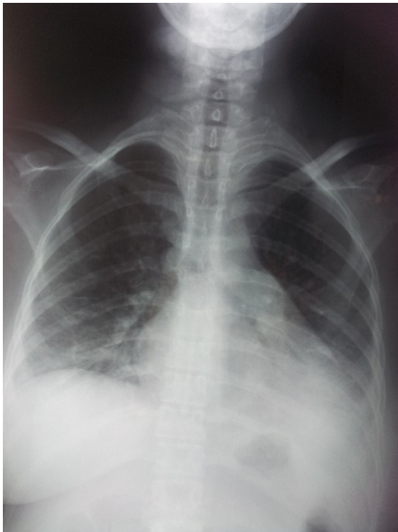
Figure 1: Chest X-ray showing bilateral interstitial and alveolar opacities and no pleural effusions

Chest X-ray showed bilateral interstitial and alveolar opacities and no pleural effusions (figure 1). The 12-lead electrocardiogram showed sinus tachycardia with no other abnormalities. Echocardiography showed normal systolic and diastolic Left Ventricular function (ejection fraction 73%) and no pulmonary hypertension. Lower limbs venous Doppler was normal.