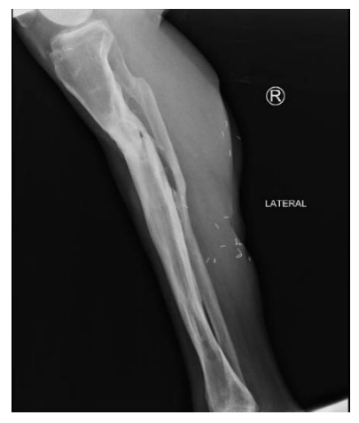
Figure (3a): X-ray two years later showing full consolidation of the docking site and healed status.

Muscle-strengthening exercises were taught to the patient and continued at home until the targeted lengthening was achieved. After achieving the target length of the bone, the patient underwent for docking of the segment by an iliac bone graft. After the bone graft and docking, the patient was kept on the Ilizarov apparatus for six more months for complete healing. After Ilizarov apparatus removal, the patient was kept in a walking cast for two months and instructed to perform full weight-bearing on the right lower limb. The overall healing was very good except for a few incidents of infection, and the patient ultimately showed nearly a full range of motion in both the right knee and right ankle. The patient was followed for three years (Figures 3a and 3b), during which time, he returned to his preinjury functional activities and rejoined his job as a teacher. The total duration on the Ilizarov apparatus was 26 months and five days and the healing index was 1.32 months per centimeter of bone growth. The characteristics and events of the case are given in Table 1. The patient's written informed consent was obtained for publication of his case study before writing this case report.