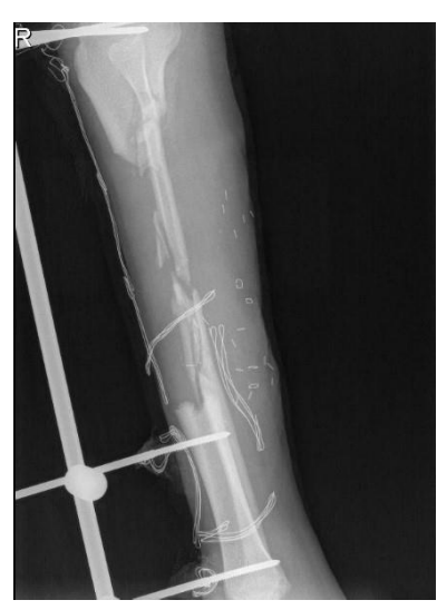
Figure (1a): X-ray showing the entire bone defect of the tibia before the Ilizarov procedure