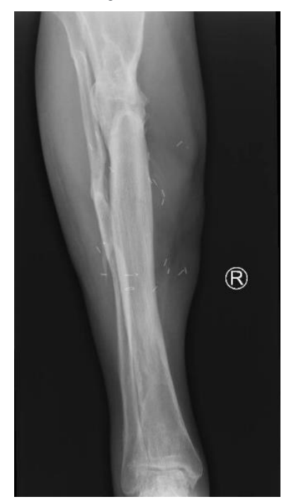
Figure (3b): X-ray two years later showing full consolidation of the docking site and healed status.