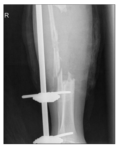
Figure (1c): X-ray showing the lower bone defect of the tibia before the Ilizarov procedure.

The patient was assessed in our hospital and further debridement was performed, ending up with 21.49 cm of bone loss from the middle tibial segment (Figure 2a).