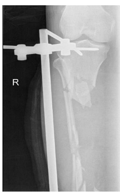
Figure (1b): X-ray showing the upper bone defect of the tibia before the Ilizarov procedure.