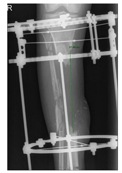
Figure (2a): X-ray showing 21.49 cm bone deficit on the <u>Ilizarov frame.</u>

The plastic surgeon established a local flap to cover the skin defect and the patient was taken for bone transplant surgery with an Ilizarov frame in place aiming to prepare him for retrograde monofocal transport. He was kept on the frame for seven days, then bone transport was performed at a rate of 1 mm/day (Figure 2b).