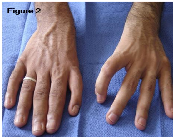
Figure 2: syndactyly of the left thumb and the index finger and triphalangeal right thumb with abnormal implantation.