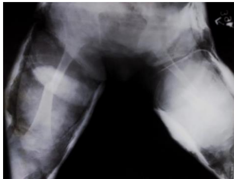
Figure 2: Antero-posterior radiograph of a patient with bilateral femur fracture immediately after hip spica application