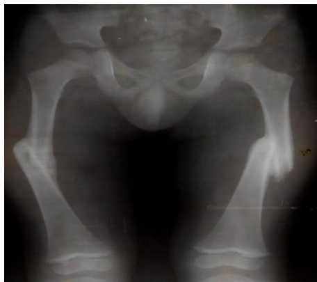
Figure 4: Radiograph of bilateral femur fracture at 5 months follow-up