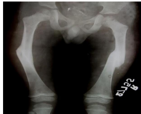
Figure 5: Radiograph of bilateral femur fracture at 7 months follow-up