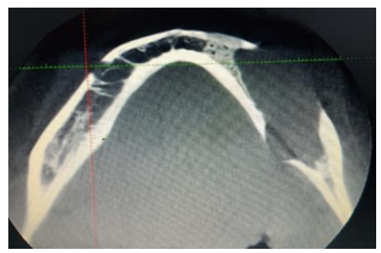
Figure 4: Axial View of the Cbct Showing A Hypodense Lesion in the Left Region of the Mandible with Perforation of the Vestibular and Lingual Cortical Bone.

An aspiration test of the lesion with a 2,5 syringe was also done that showed the presence of a citrus cystic liquid. Based on clinical and radiographic presentation of a well-defined radiolucency, located inthe periapical position relating to the roots of non-vital tooth 36, and with liquid content,the first differential diagnosis was radicular cyst, but other lesions such as keratocyst or a unicystic ameloblastoma couldn't be eliminated.