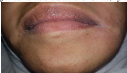
Figure 1: Extraoral Image Showing Swelling on the Left Cheek Region

On extraoralexamination, aswelling on the left cheek region was noticed, covered with a normal skin. (Figure 1)