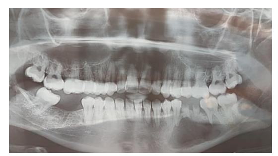
Figure 3: Panoramic Radiograph Showing a Unilocular Radiolucent Lesion in the Periapical Region of 36.