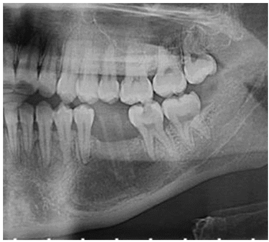
Figure 6: Panoramic Radiograph 5 Months after Decompression.