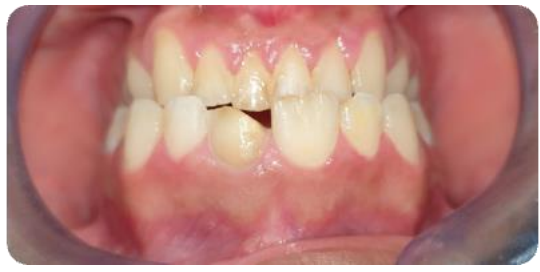
Figure 11: Final preparation.

The impression is taken using Silicone A, with the doublemix technique to accurately capture the cervical limit intrasulcularly. After disinfection, the impression is digitally recorded directly using a tabletop scanner (extraoral).