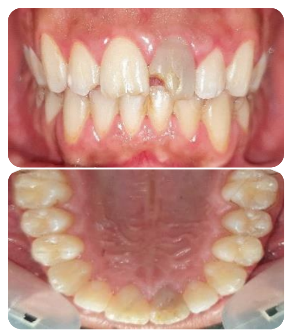
Figures 1 and 2: Initial state.

Due to the limited coronal damage on tooth 21 and the notable dental discoloration observed, the preferred treatment plan involves endodontic retreatment and implementing internal bleaching as a preprosthetic therapeutic measure, which will be followed by coronal restoration using a full zirconia veneer.