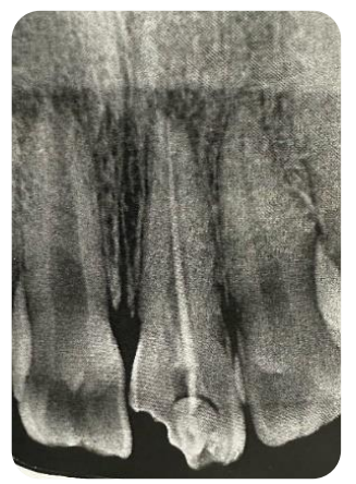
Figure 3: Radiograph of initial state.