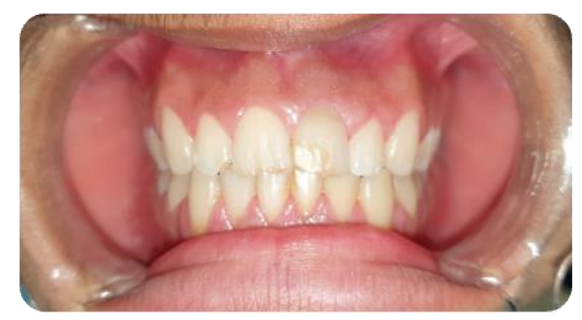
Figure 5: Result after internal bleaching of tooth 21