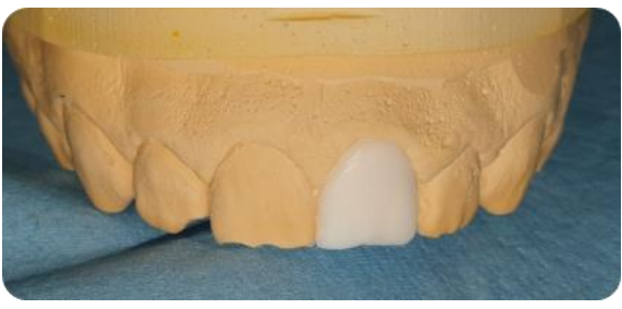
Figure 6: Wax-up.

The current approach involves using the final morphology of the restoration as a reference for the preparation shape. This morphology is developed in the form of a provisional wax-up that aligns with the aesthetic plan (Figure 6). The study model modified by this wax-up serves as the foundation for creating silicone keys, enabling the fabrication of the esthetic mask (Figure 7) and guiding the preparation.