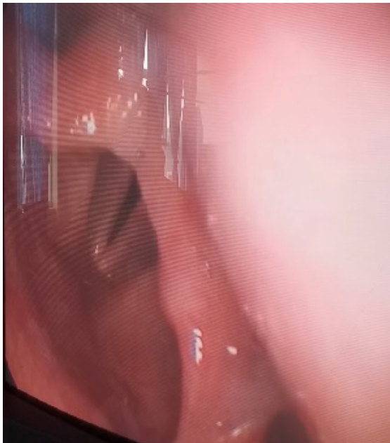
Figure 1: indirect laryngoscope during inspiratory phase shows narrowing of rima glottides.

On examination she is bed ridden, presence of severe bradykinesia, tremor and severe rigidity. There is inspiratory stridor. No anterior neck mass on examination. Indirect laryngoscope (Fig. 1, 2) showed vocal cord in paramedian position with collection of secretion. Her laryngeal sensation is also reduced. The results of laboratory test was noncontributory. Chest x-ray were unremarkable with normal mediastinum.